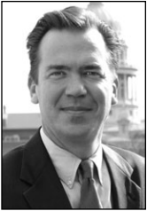
By Paul J. Sugg TAC Legislative Staff

Below please find the bills we've been following in this corner of the newsletter. As with the rest of the publication, we include, the bills that passed and those that failed. The last action noted tells you a bill's status: if it has an effective date, or in case of HJR 14, an election date, if passed.