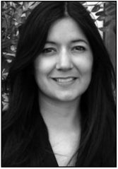
By Laura Garcia TAC Legislative Staff

On June 18, the U.S. Senate Environment and Public Works Committee approved S.787 by Sen. Feingold (D-Wis.), also known as the "Clean Water Restoration Act." The legislation revises the Clean Water Act, broadening its jurisdiction by removing the word "navigable" from the definition of "waters of the United States." The change could have the effect of authorizing federal jurisdiction over waters usually regulated at the state or